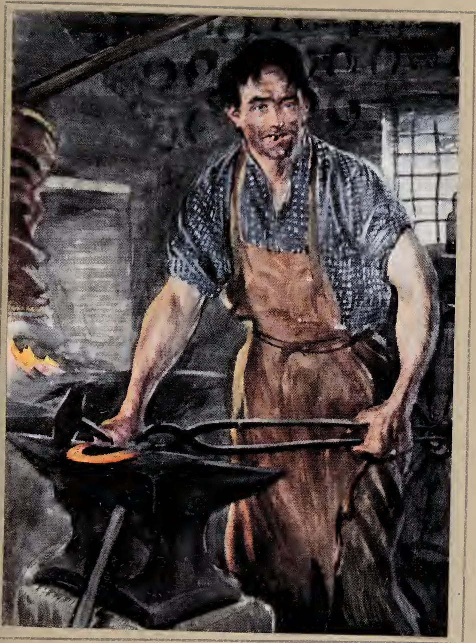
"A WILD, GRIMY FIGURE OF A MAN . . . FASHIONING A PIECE OF IRON."